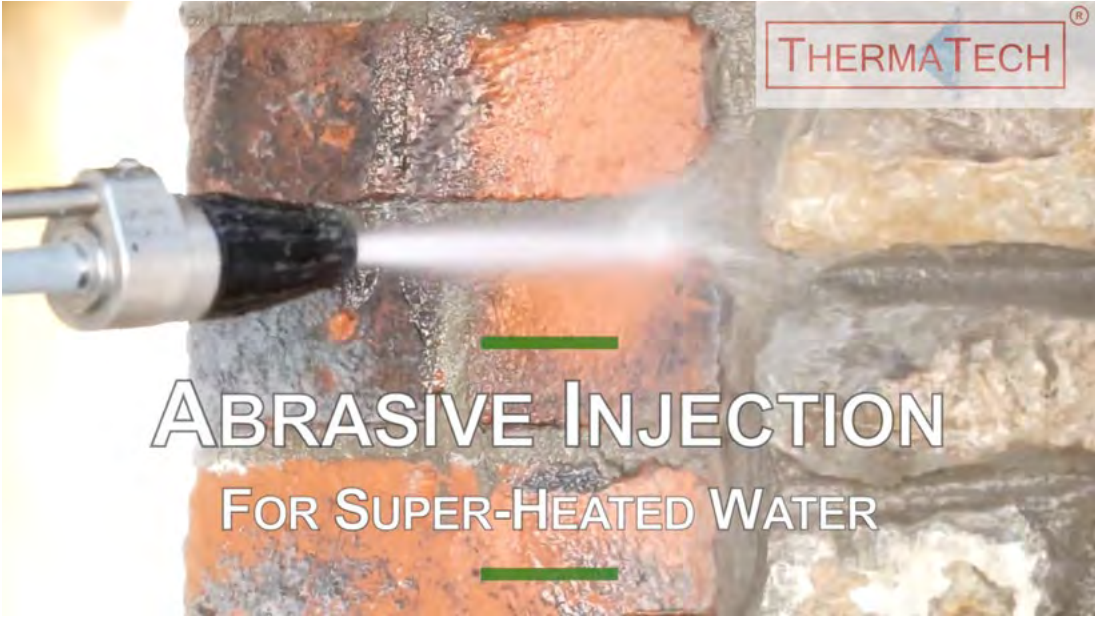
Click on the image above see a demonstrational video and explanation

This abrasive attachment kit is specifically designed to connect the ThermaTech® gun and can be used up to 100°C temperature.