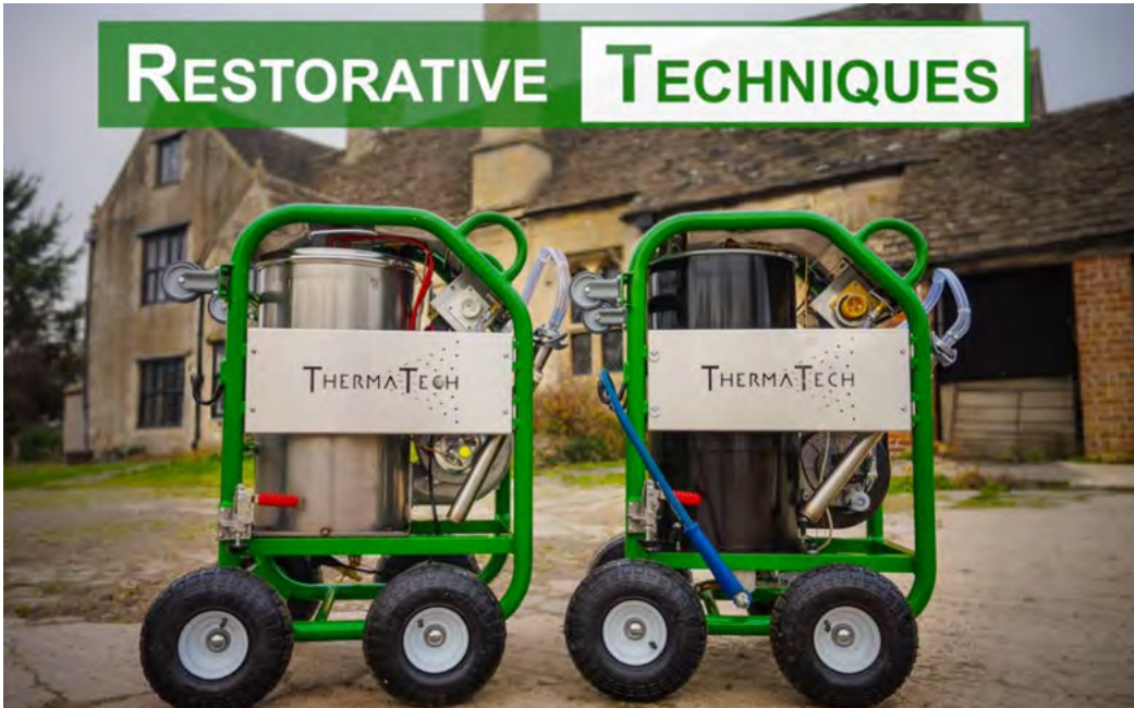
Click on the image above see a demonstrational video and explanation

By using high efficiency motors and minimal water, it yields positive results for COSHH and REACH in safety and environmental risk assessments.